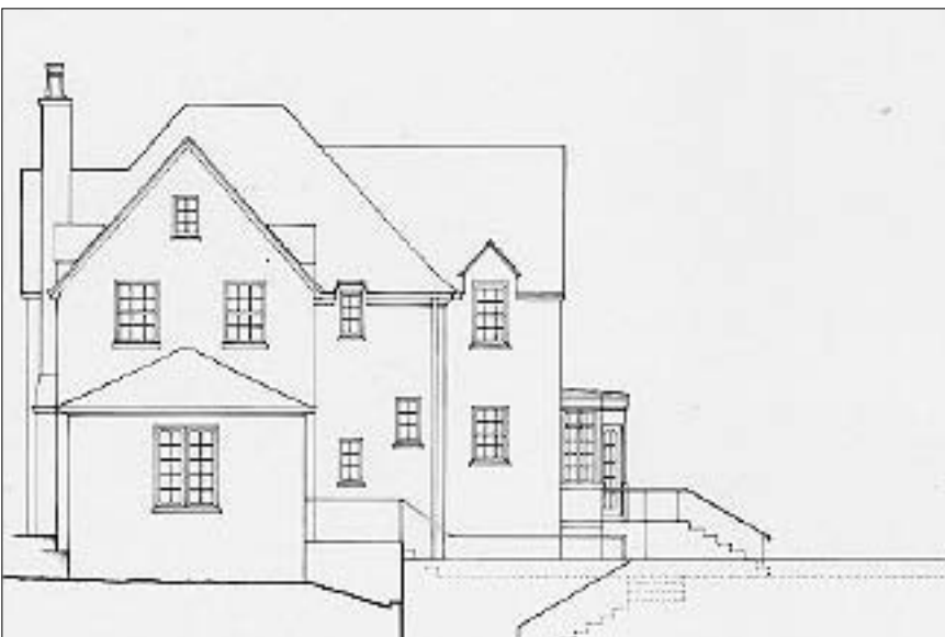
SOUTH ELEVATION / BEFORE