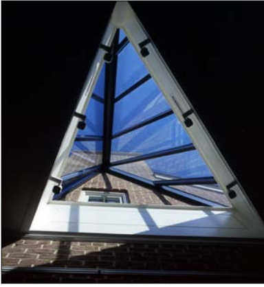
TOP ROW DETAILS (FROM LEFT TO RIGHT): THE NEW SKYLIGHT; THE PHASE 02 ADDITION AS SEEN FROM THE WATER'S EDGE; THE FRONT BRICK END WALL