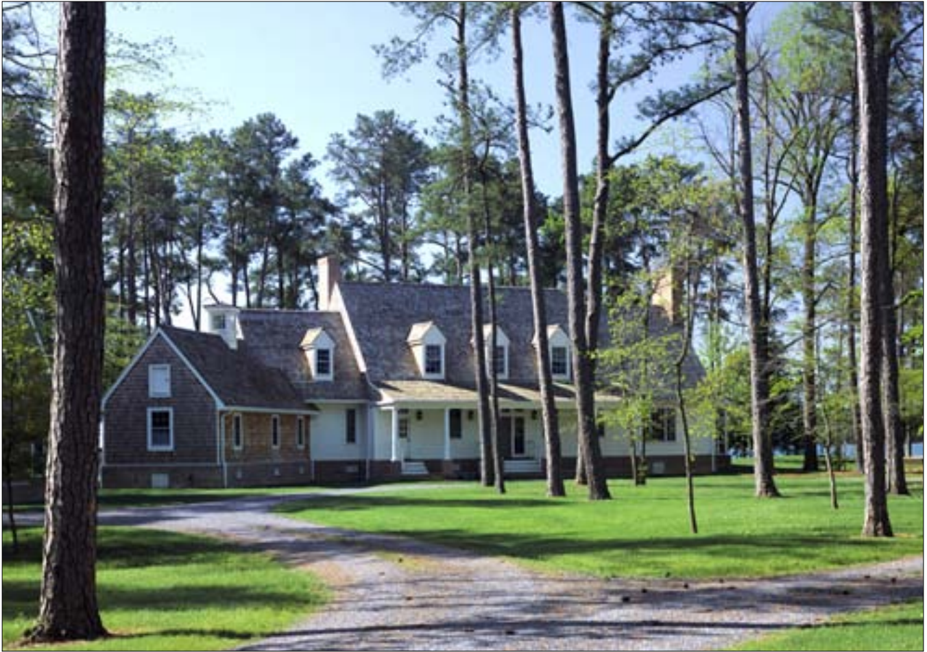
THE ENTRY PORCH AND CURVING ARRANGEMENT OF BUILDING FACADES BEFORE CONSTRUCTION OF THE WESTERN-MOST ADDITION IN PHASE 02 OFFERS A WELCOME INVITATION WITHIN A WOODLAND CLEARING.