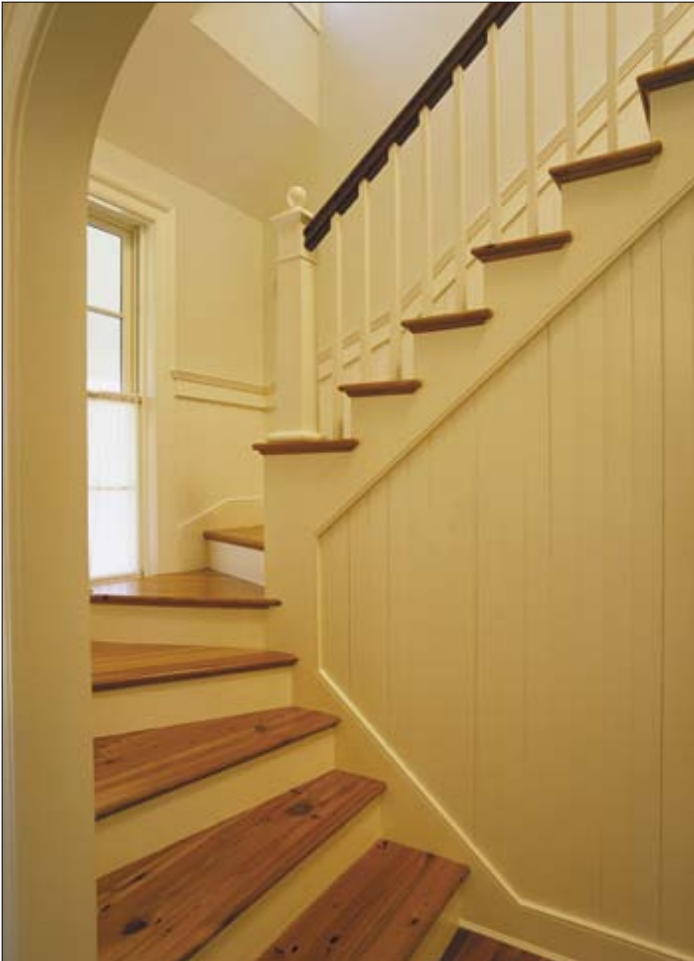
DETAILS (CLOCKWISE FROM UPPER LEFT) SUCH AS A PROJECTING BALCONY, GLAZED ROOF LANTERN, HULL-SHAPED CEILING AND SIMPLE INDOOR STAIRWAY FURTHER ALLUDE TO THE REGION'S MARITIME HISTORY OF WOODEN BOAT BUILDING, AND ARE SEAMLESSLY INCORPORATED INTO THE HOUSE'S FINAL DESIGN.