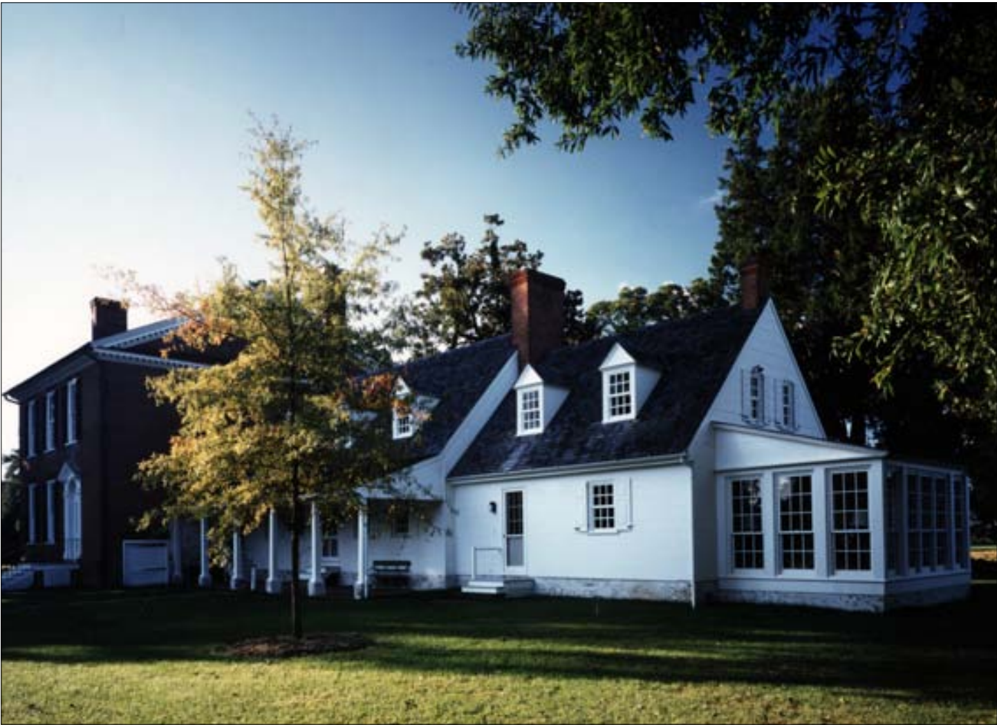
MAIN HOUSE WITH KITCHEN WING