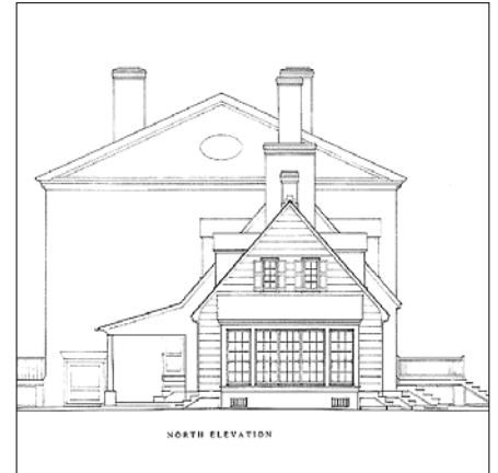
NORTHWEST ELEVATION, MAIN HOUSE