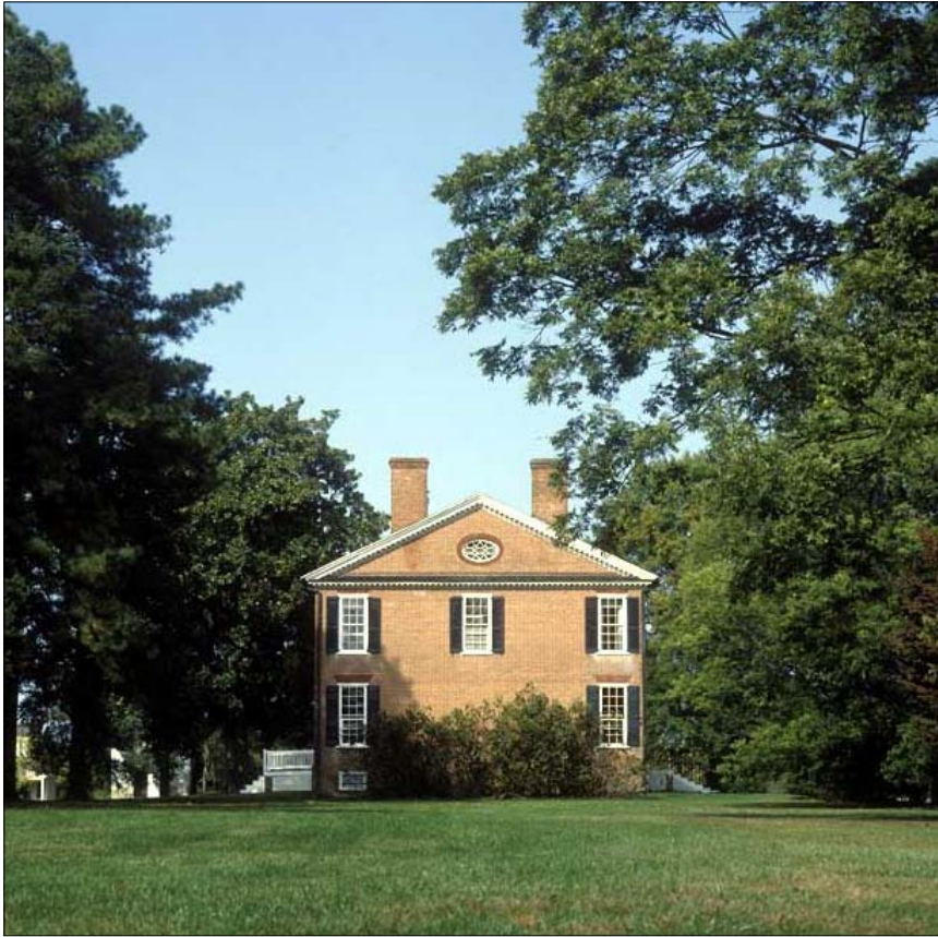
MAIN HOUSE FROM SOUTHEAST