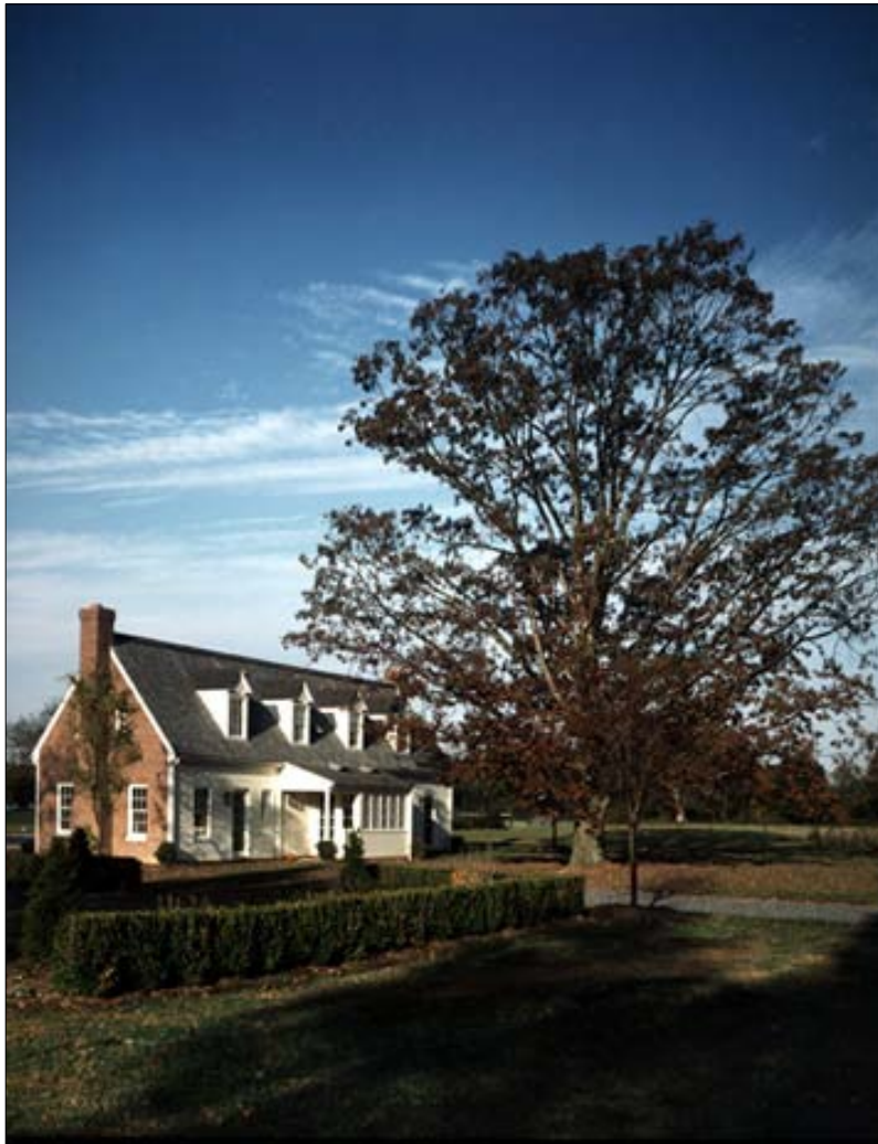
POOLHOUSE AND OAK TREE

LEFT TO RIGHT: POOLHOUSE, SERVICE BUILDINGS AND MAINHOUSE AS SEEN FROM THE WATER.