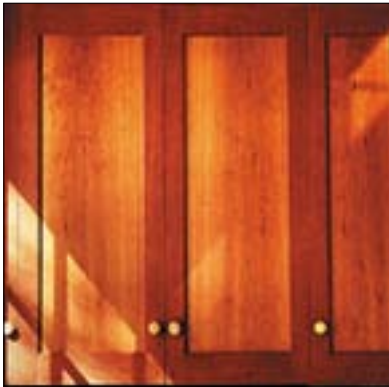
EXAMPLE OF CUSTOM CASEWORK