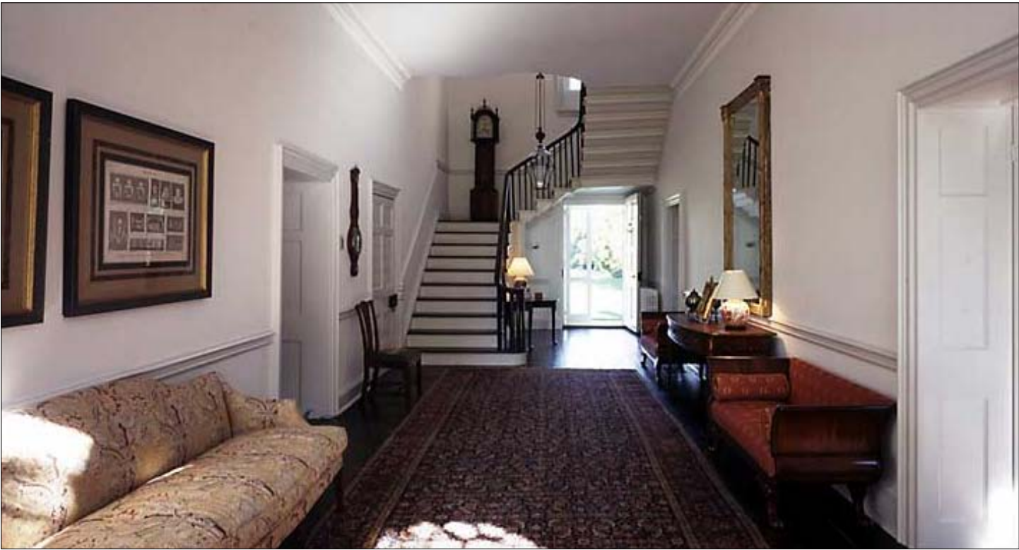
MAIN HOUSE — ENTRY HALL