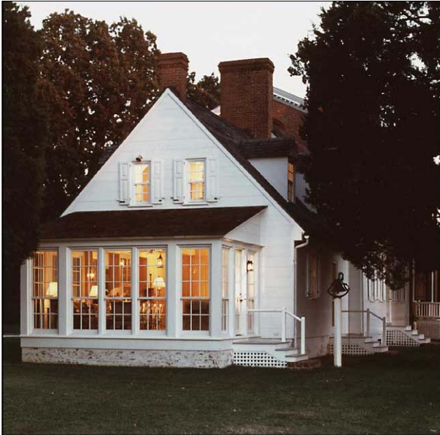
KITCHEN WING WITH GLAZED PORCH ADDITION